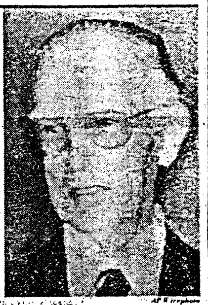
OTTO VON BOLSCHWING He's accused of SS role

He also allegedly provided information to the SS on people